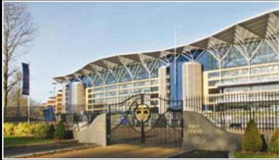
Entrance to Ascot Racecourse

A prestigious address, a professional and stimulating environment with a fantastic location close to Ascot Racecourse